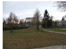
G.D. Archibald West