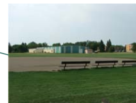
G.D. Archibald Memorial